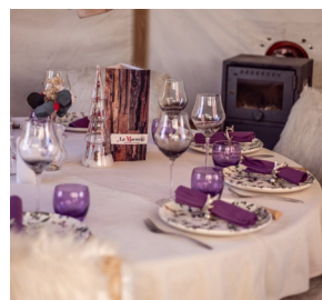
La Marmite (Bruyères)