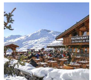
Le Ferme de Reberty (Reberty)