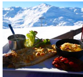
L'Antigel (Les Menuires Piste)