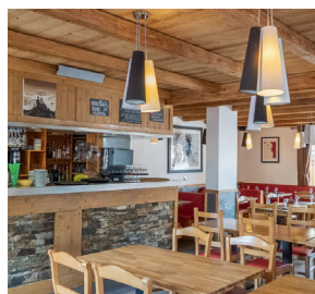
La Chouette (Bruyères)

Les Bruyères and Reberty 2000 have a few cosy, welcoming bars if you fancy heading out for an après ski drink or two by foot. Les Menuires has a much busier nightlife atmosphere where there are plenty of bars with live music, compared to the quieter hamlets of Les Bruyères and Reberty 2000.